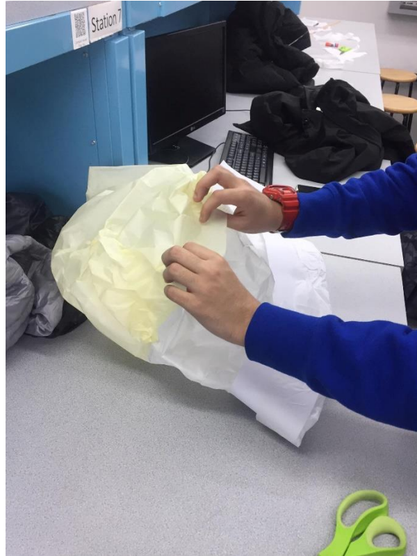
Figure 3: Balloon Top Being Applied

Using scissors, the sheet of drawing paper was cut in half along its length to create two pieces of drawing paper that had the same width and length. The two pieces were glued together at their width with an overlap of 2.50 cm. The same was done at the other end of the now single strip of drawing paper forming a ring. The ring was glued to the opening of the balloon. Two straws were taped together to form a large plus sign. That plus sign was then taped into the balloon opening to keep the strip of drawing paper from closing (Figure 4).