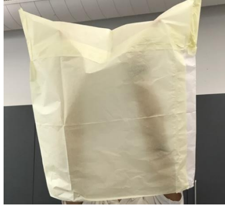
Figure 5: First-place Balloon

The third-place balloon had a single trial producing a CE of 4.84 (Figure 6). Its volume was 0.50 \text{ m}^3 . It had a payload of three paperclips with a time afloat of 1.55 s and a cost of $0.96.