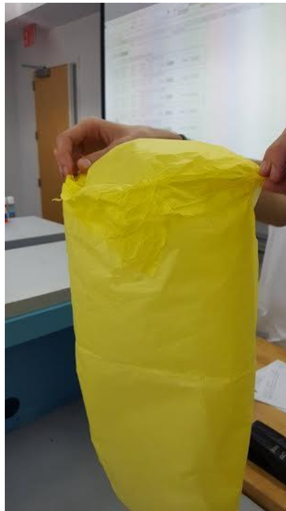
Figure 6: Third-place Balloon

The third-place balloon had a single trial producing a CE of 4.84 (Figure 6). Its volume was 0.50 \text{ m}^3 . It had a payload of three paperclips with a time afloat of 1.55 s and a cost of $0.96.