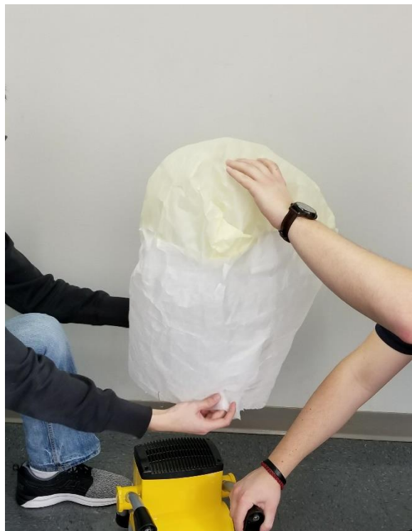
Figure 7: Hot Air Balloon, Final Design

The final design of the hot air balloon cost $0.48. One sheet of drawing paper, three sheets of tissue paper, 30.00 cm of Kevlar string, and 30.00 cm of adhesive tape were purchased to build the balloon though most of the adhesive tape and all of the Kevlar string were not used in the design. The drawing paper was used in the initial design, but discarded in the design that produced a time afloat (Figure 7).