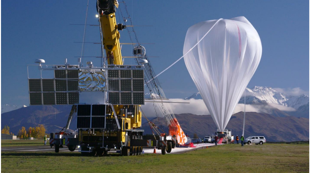
Figure 1: NASA Super-Pressure Balloon (NASA, 2017)

More common types of hot air balloons are dirigibles, blimps, and aerostats.